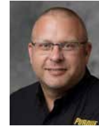
Kyle Daniel Landscape & Nursery Production