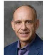
Petrus Langenhoven Horticulture & Hydroponics